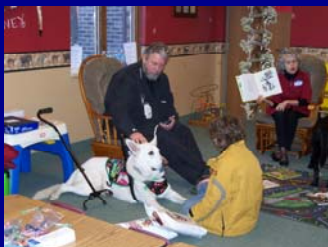
Livingston ladies enjoying their local senior center